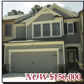
Lot #58 (Glade A) 3 Bdrm, 2.5 Bath