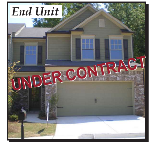
Lot #66 (Briar A) 3 Bdrm, 2.5 Bath