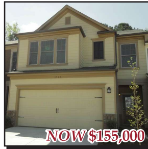
Lot #59 (Emory A) 3 Bdrm, 2.5 Bath