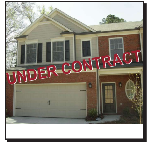
Lot #61 (Herrington B) 3 Bdrm, 2.5 Bath