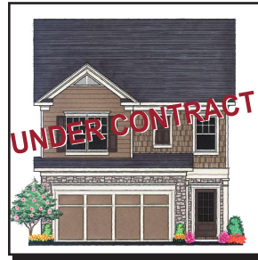
Lot #60 (Crawford C) 3 Bdrm, 2.5 Bath