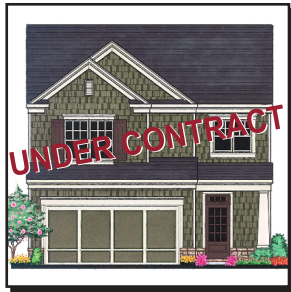
Lot #57 (Briar B) 3 Bdrm, 2.5 Bath