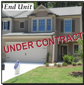
Lot #62 (Springer A) 3 Bdrm, 2.5 Bath