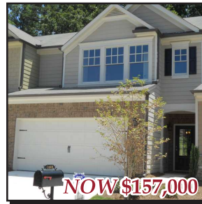
Lot #63 (Glade B) 3 Bdrm, 2.5 Bath