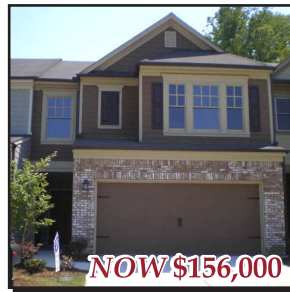
Lot #68 (Emory B) 3 Bdrm, 2.5 Bath